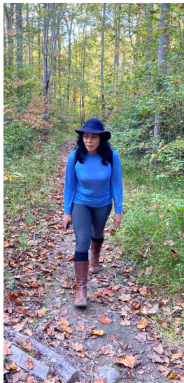
On the Continental Army Road at Kings Mt.

1. If you are an Oregon veteran, sit down and share a service story with a family member, friend, loved one, or community member and record a conversation about your military experiences for 30 minutes or lon-