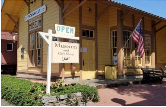
Visit the Brownsville Historical Museum