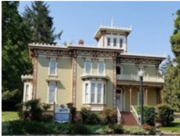
Visit the Moyer House

Do a walking tour of the Historical Town of Brownsville and/or join in the fun at the Linn County Pioneer Picnic at Pioneer Park. It is the oldest, annual, continuously held event in Oregon! They had a front porch parade instead during the last two years of Covid-19.