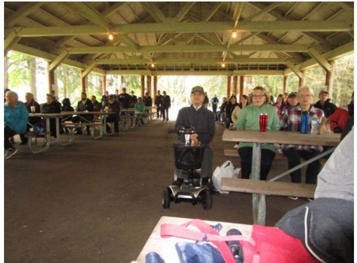
Founders Day Attendees

About 8 members of the Sons and Daughters attended Founder's Day on April 30, 2022. It was 179th anniversary of the vote for Oregon's Provisional Government. SDOP members have been participating in the Founder's Day activities for many years.