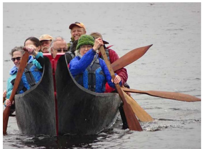
6. Clatsop-Nehalem Tribal canoe "Dragonfly".

OPB – Clatsop-Nehalem Tribes 'dreaming again' with return of ancestral land , dated Dec. 16, 2020