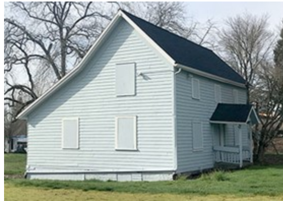
5. The house in 2021 with heritage hickory and fruit trees beyond.

Today, the house remains remarkably intact. A new roof and replacement lapped siding protect the original vertical boards. Some historic wallpaper remains. It was printed with reflective inks and applied directly to the boards to make the most of candlelight and kerosene lanterns while blocking drafts between the boards.