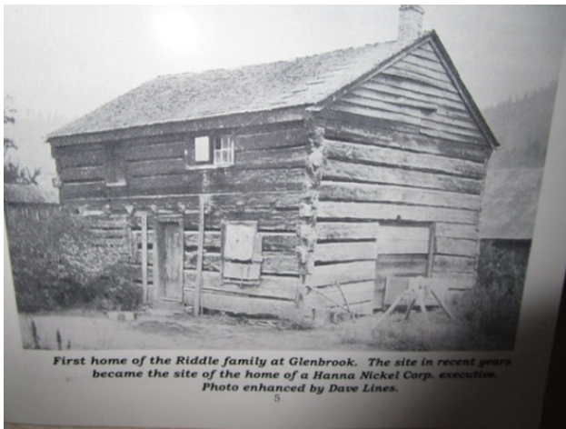
1. First Riddle house, circa 1852.