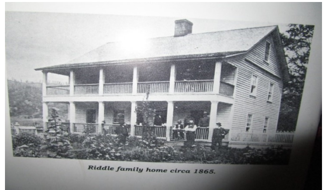
2. Second Riddle house, circa 1865