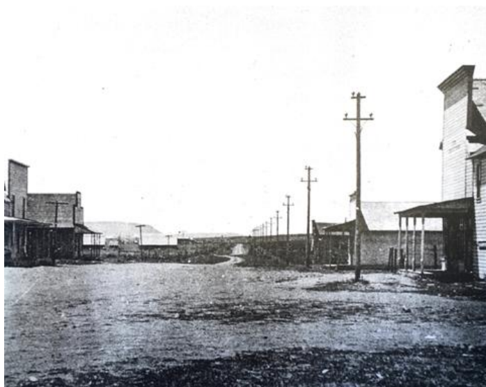
Lamonta Main Street (1908?)