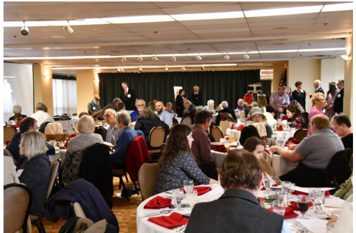
A good representation of Pioneer stock.