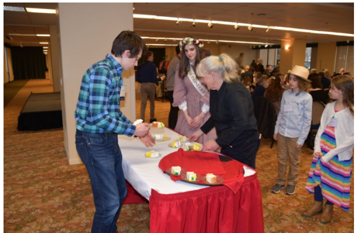
Serving the Birthday cake.