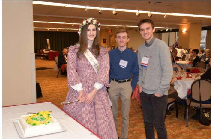
Miss Pioneer Oregon and the Scholarship winners.