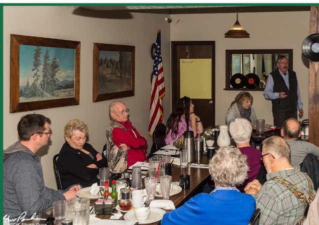
SDOP Board Meeting at the Polk County Museum, April 2018