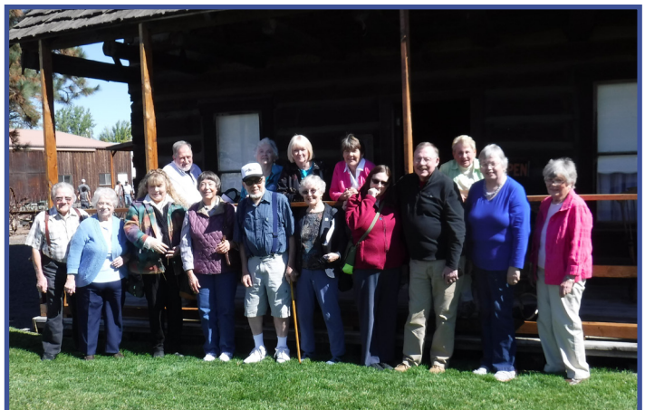
SDOP at the Dufur Historical Society Museum.