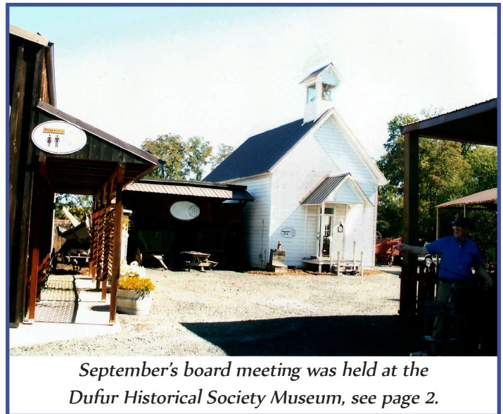
September's board meeting was held at the Dufur Historical Society Museum, see page 2.