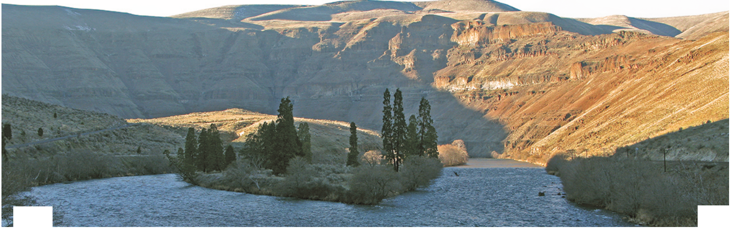
Tualatin River, Oregon