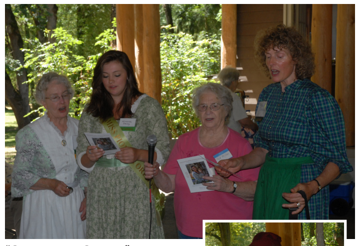
"Oregon, My Oregon"