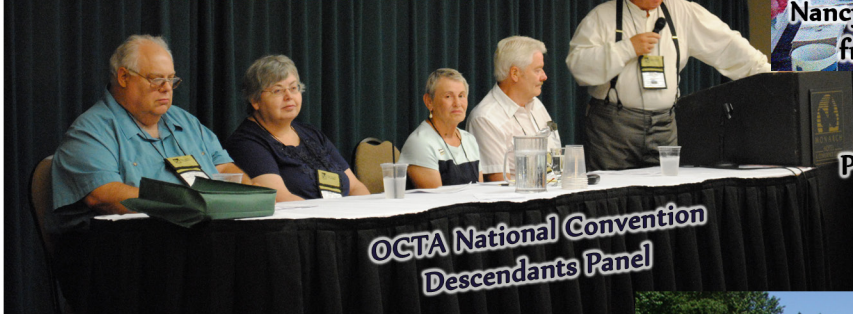
OCTA National Convention Descendants Panel