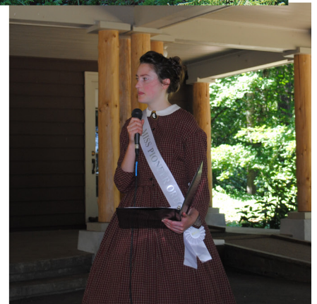
SDOP Annual Meeting and Picnic Champeog State Park