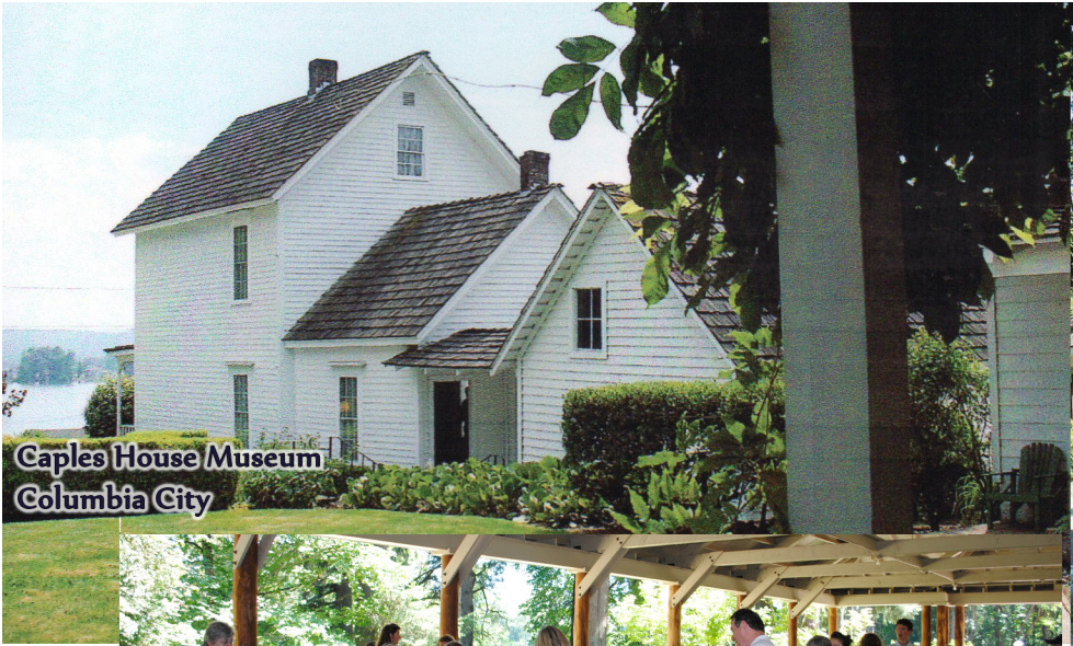
Caples House Museum Columbia City