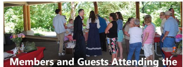
Members and Guests Attending the SDOP Champoeg Picnic 2013

I am looking forward to an exciting and historically rewarding year as the President of SDOP.