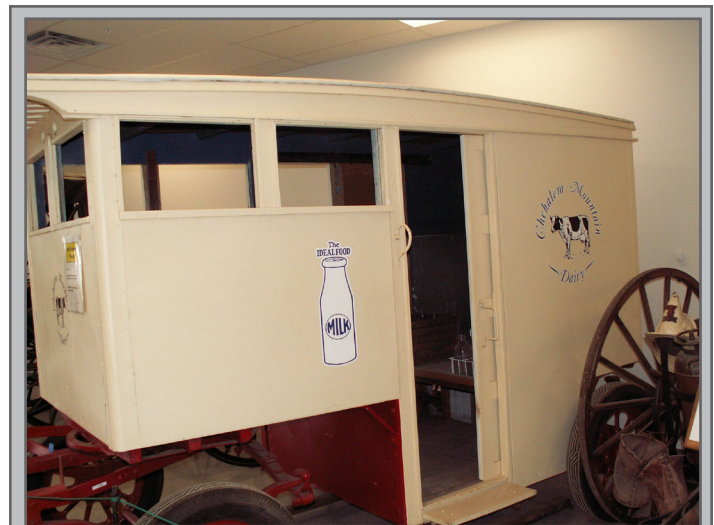
Chehalem Mountain Dairy Wagon