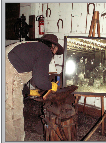
Blacksmith at work, Yamhill Valley Heritage Center

Old Business: The membership fee increase was effective June 1st. Everyone was encouraged to distribute some of the 1,500 new brochures that were printed. The next meeting will be held at Washington County Museum in Hillsboro on January 10th.