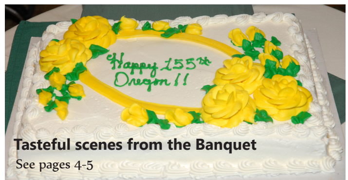
Tasteful scenes from the Banquet